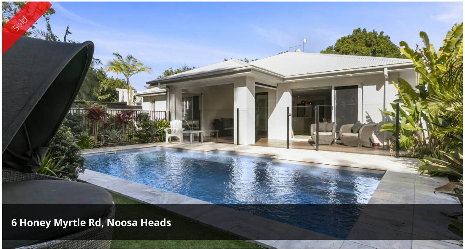
6 Honey Myrtle Rd, Noosa Heads